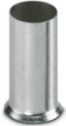
Ferrule, length: 18 mm, color: silver

Please be informed that the data shown in this PDF Document is generated from our Online Catalog. Please find the complete data in the user's documentation. Our General Terms of Use for Downloads are valid ( http://phoenixcontact.com/download )